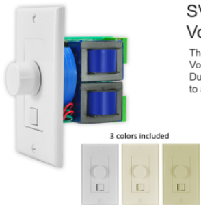
3 colors included

The OSD Audio - JAZZ Audio SVC205 is a Self-Impedance Matching Volume Controller with an on/off switch. Volume controls do not add gain (volume) to your speakers; they simply attenuate the volume up or down. During setup, you'll set the source volume to its optimum level, then the volume control turns the sound down to almost inaudible levels. The SVC205 lets you turn sound off completely with its On/Off switch.