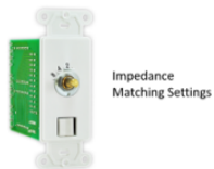
Impedance Matching Settings